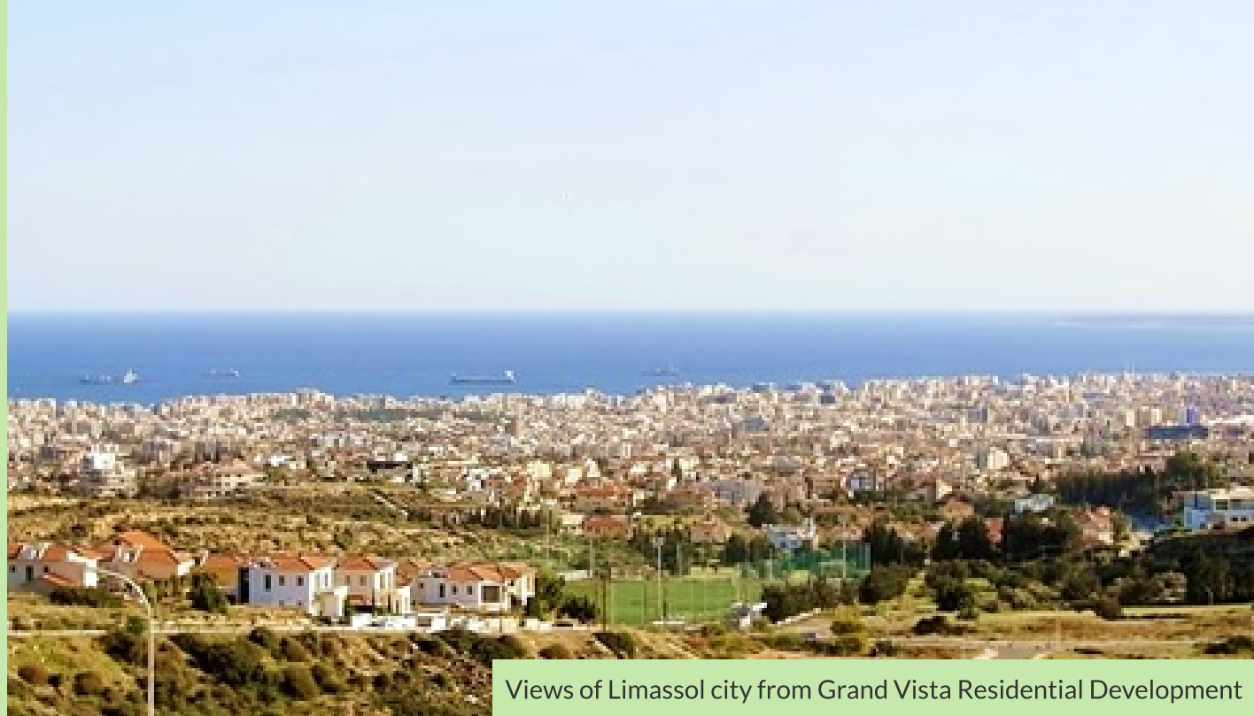
Views of Limassol city from Grand Vista Residential Development

As part of Odysseos Group, Pampaleo Estates has been involved in the Real Estate sector in Cyprus and abroad for over 3 decades, and currently owns and develops vast areas of land in prime locations across the Island, such as beachfront properties, commercial plots, residential properties with stunning views of the Mediterranean, forestland, as well as various shops and luxurious apartments.